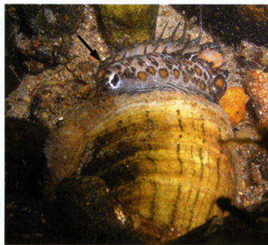
The lure of the wavy rayed lampmussel with its prominent eyespot resembles a minnow or other small prey fish. The lure—a fleshy extension of the mussel's mantle attached to the inside of its shell—is indicated by the arrow.

There are nearly 1000 species of freshwater mussels worldwide, but